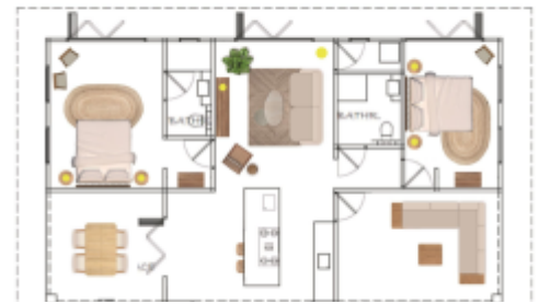
Type A (Detached Villa)